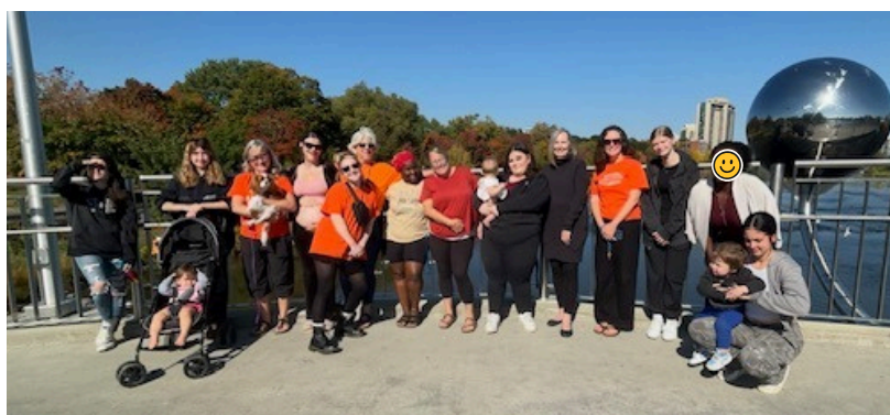
Pictured above: Clients and staff on an outdoor reflection walk in honour of National Day for Truth and Reconciliation

We are grateful for our partnership with Wabano Centre for Aboriginal Health as their Youth Outreach Worker led a discussion and reflection on the origins of the National Day for Truth and Reconciliation. Our partners at Wabano continue to facilitate small group activities, based on the needs and interests of the clients, with an ongoing collaboration and referrals to culturally responsive services.