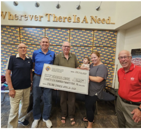
Knights of Columbus Council #7873 cheque presentation for a donation of the proceeds from the Spring 2025 Italian Dinner Fundraiser. Save the 2026 Date: April 26th