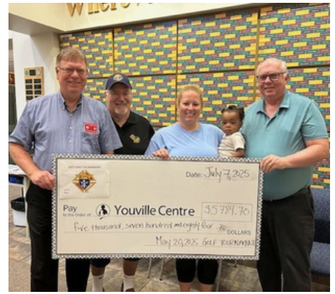
Knights of Columbus Council #9544 cheque presentation of funds raised from the May 2025 Golf Tournament. Youville is grateful to be a charity recipient of this event in 2026. Save the 2026 Date: May 20th